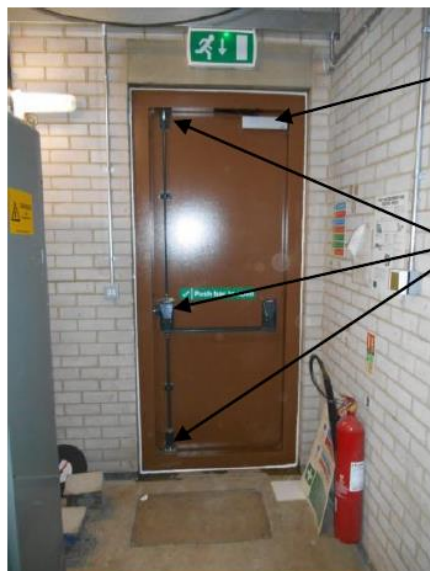
Door closer (on all FR Doors)