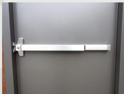
INTERNAL PUSH BAR