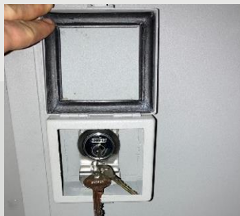
EXTERNAL KEY & HANDLE IN WATERPROOF BOX